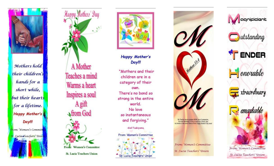
Bookmarks distributed to members